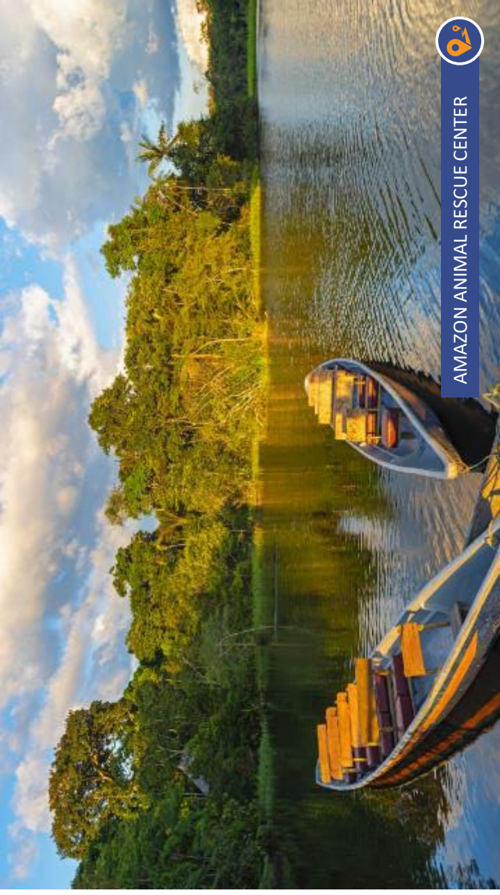
AMAZON ANIMAL RESCUE CENTER