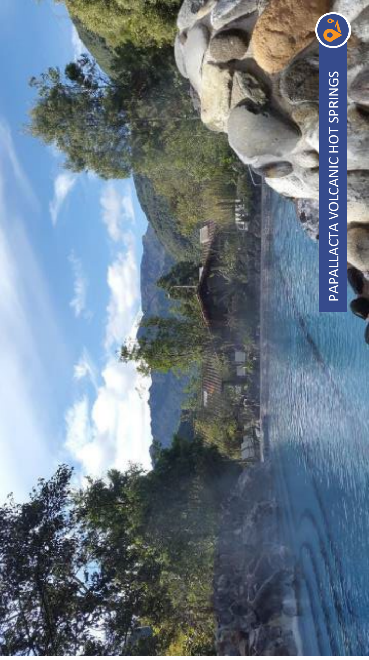
PAPALLACTA VOLCANIC HOT SPRINGS